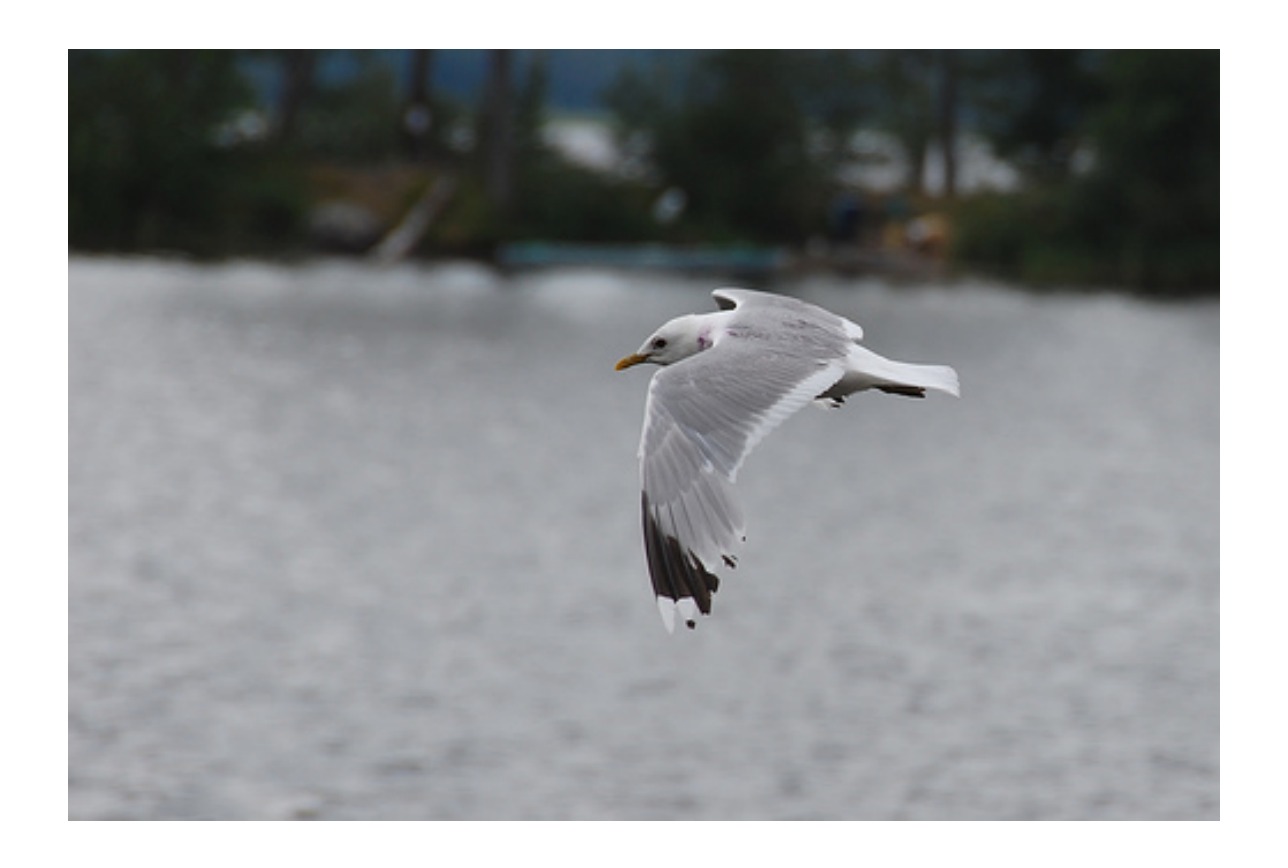
He taught me to capture the Breath of Life and build a Sail. Thus doing so, i found that my Sailing and Navigating of the Seas of my life was completely within my control.