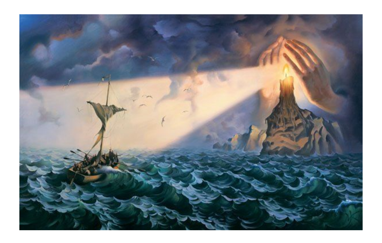
and . . .

i was bemused and pleased. As time went on and on . . . the Sea was the Sea, but time continually went on. Some days went peaceably slow, and some treacherously Fast and Stormy. The currents of life dictated my days instead of me. i was being troubled from within for my lack of control,