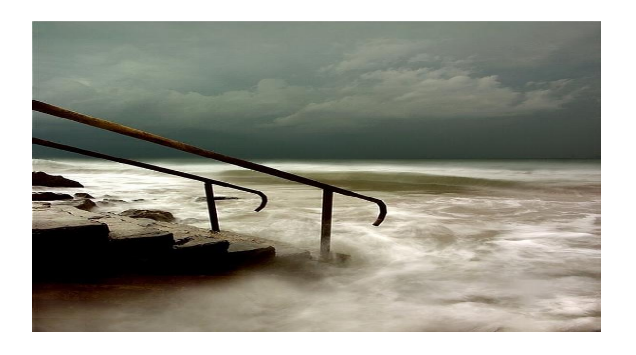
My Son . . . you have always had purpose . . . that is but to be My Child.

You have always had a Destination . . . through all your times of trouble . . . ME! I AM your Destination!