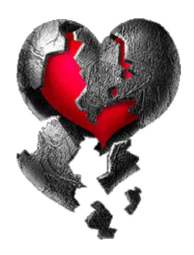
Poetry ... Prose ... Prayers ... Stories